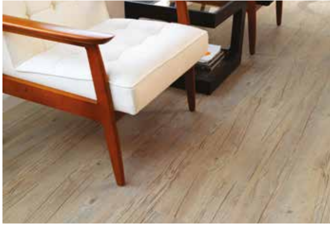
■ VGW921-ZLLST ▽