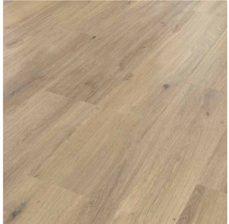
Canadian Urban Oak RKP8116